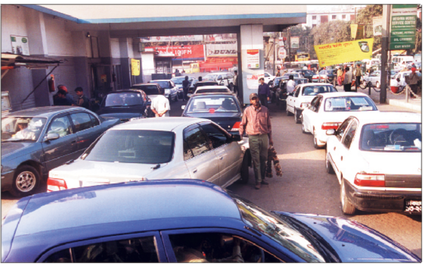
Motorcars queue up for fuel at a filling station in the city yesterday as petroleum dealers, distributors, agents and petrol pump owners go on an indefinite strike from today.

people by spending our own money." Meanwhile, most of the filling stations in the city pulled the shutters down from last night. But the government depots would remain open, said the state minister. Earlier at the talks, the state minister asked the association leaders to form a committee, comprising representatives from petroleum agents and dealers, and the energy ministry, for evaluation of their demand. The leaders turned down the minister's offer and stuck to their strike decision. Mosharraf Hossain said with law enforcers in action, petroleum