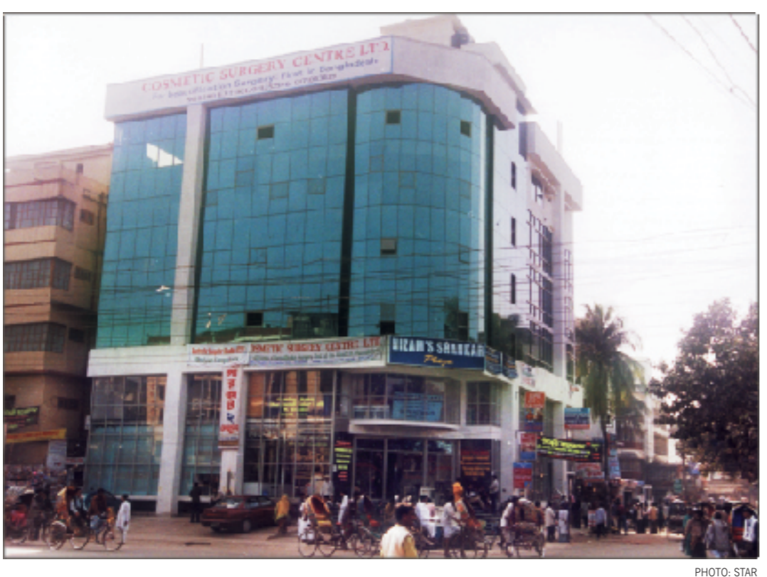
A six-storey shopping mall at the Shankar intersection on Satmasjid Road has been constructed with the walkway in the front converted into a parking space.