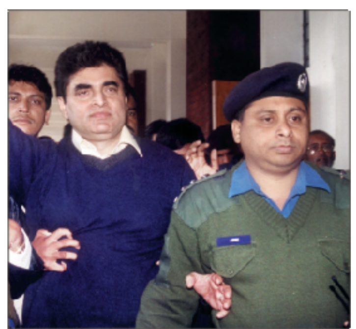
Former Awami League lawmaker HBM Iqbal is on his way to the Dhaka Central Jail yesterday. The Speedy Trial Tribunal, Dhaka Division sent him to jail in connection with the Malibagh killings.