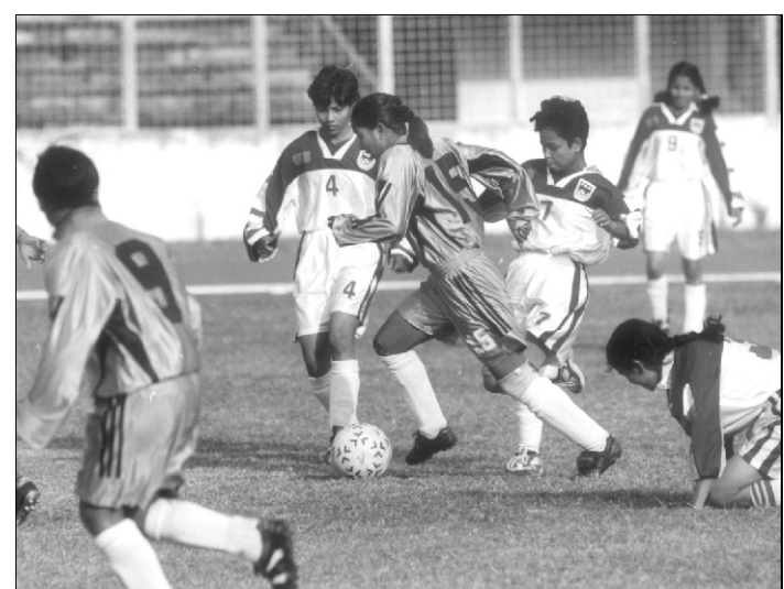
Action from the friendly match between Bangladesh women's football team and the visiting West Bengal side at the Mirpur Sher-e-Bangla National Stadium yesterday.