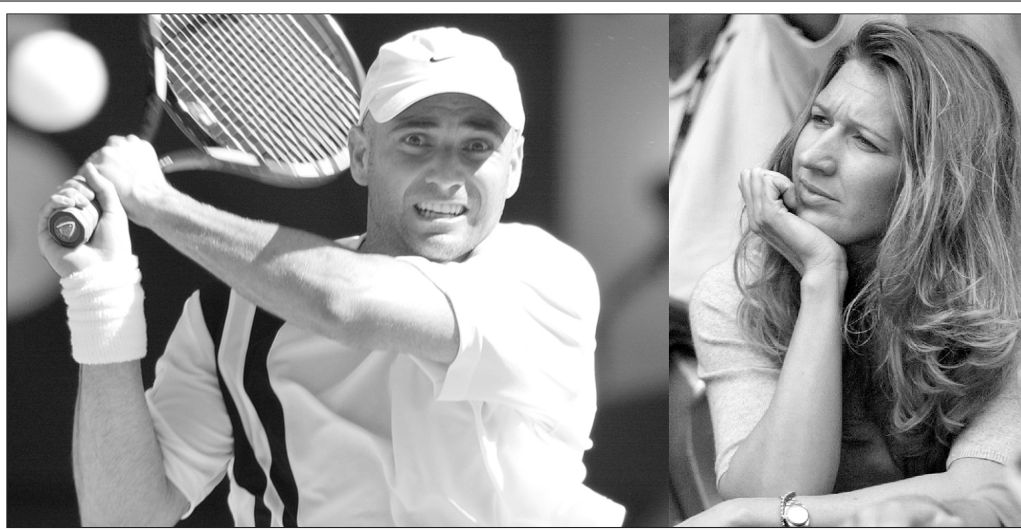
ROMANCING IN PARIS: Andre Agassi and Steffi Graf.

BSS, Dhaka Bangladesh Rifles (BDR) maintained their winning streak in the National Bank Premier Volleyball League defeating Bangladesh Police 26-24, 30-28 and 25-21 at Dhaka Volleyball Stadium yesterday. This was BDR's sixth win in a row, while Police tasted first defeat in their sixth match. Water Development Board (WDB) beat Wari Club 25-11, 25-11 and 25-19 in the other match of the day.