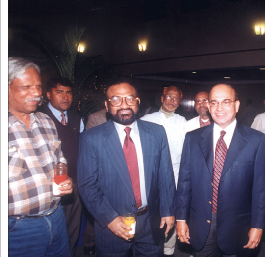
Ministers, political leaders, diplomats and civil society members at the launching ceremony of the Newspaper Owners Association of Bangladesh (NOAB) at a city