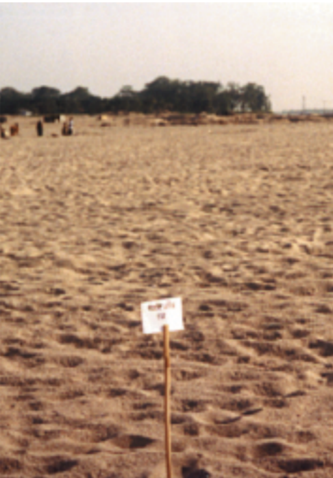
Workers head-load stones and sand extracted from a quarry on the Sylhet border unsettling ecological balance and (right) a makeshift signpost in place of a missing border pillar shows the invisible borderline. Encroachment and mindless stone collection are changing the borderline and river course.