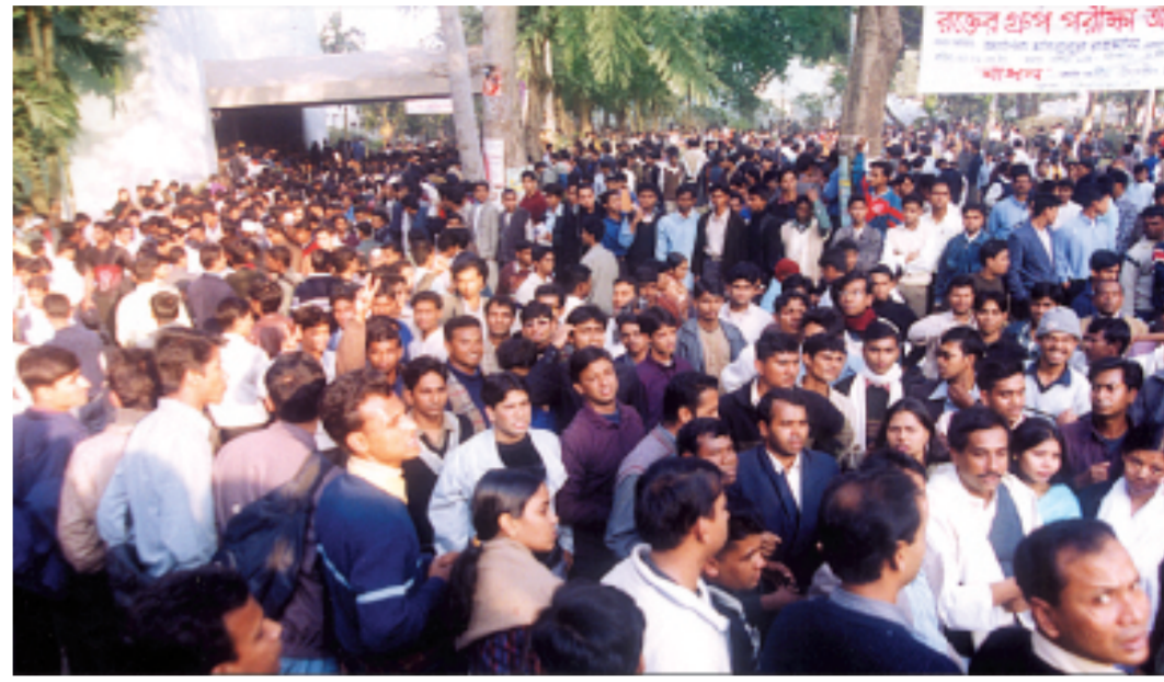
Hundreds of students stream out of a Dhaka University examination hall after their Honours admission test under the Faculty of Commerce yesterday. (Story on page 3)