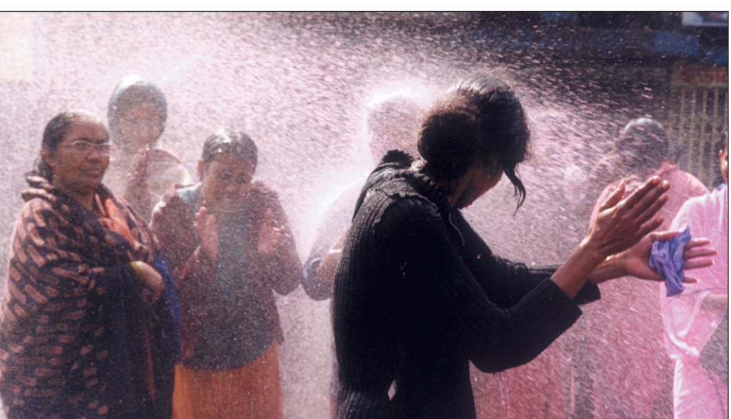
Women Awami League (AL) activists come under jets of coloured water from water cannons policemen used to break up the party processions on the Bangabandhu Avenue in the city during an AL-enforced hartal yesterday.