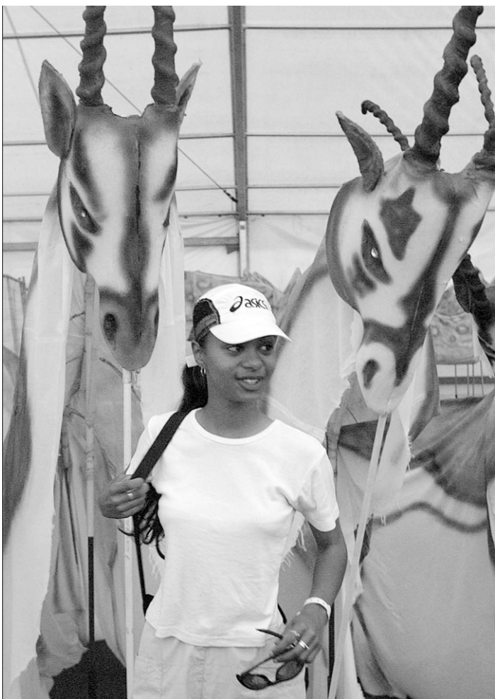
A young performer poses in front of some dummy zebras at the Newlands Cricket Stadium in Cape Town on January 14. These props will be used during the opening ceremony of the World Cup next month.

However, Lamb admitted it would be helpful if there could be a "re-visit" of Zimbabwe's safety and