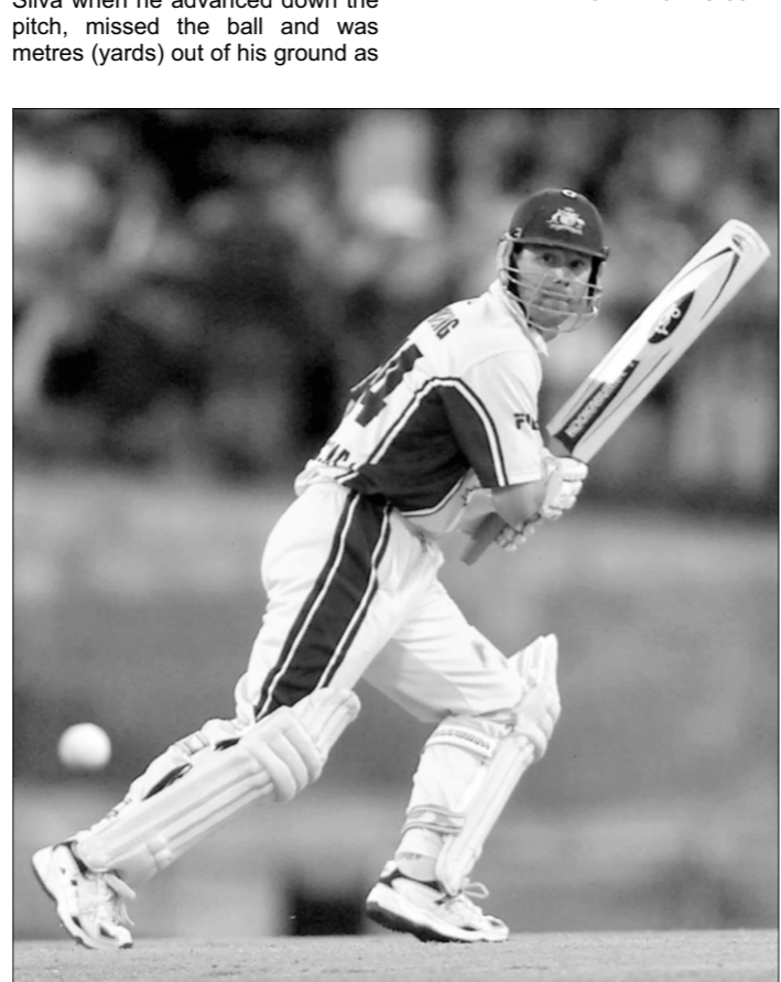
Australia captain Ricky Ponting sets off for a run during the day-night match against Sri Lanka at the Gabba yesterday.

Sangakkara completed a second stumping. Australia's fortunes were improved by fifth-wicket pair Darren Lehmann and Michael Bevan, who cracked 72 from 92 balls before Lehmann was run out for 38, leaving Australia still 40 runs short. In Sri Lanka's innings, a fighting 70 from 101 balls by stylish opening batsman Marvan Atapattu saved Sri Lanka from a complete rout. Atapattu and Mahela Jayawardene (56 from 90 deliveries) fashioned a crucial fourth-wicket stand of 112 after the side was on its knees with 35 for three in the 13th over. But their spirited effort was largely undone when the last six wickets toppled for only 64 runs. Atapattu cracked seven boundaries in his two and a half hour