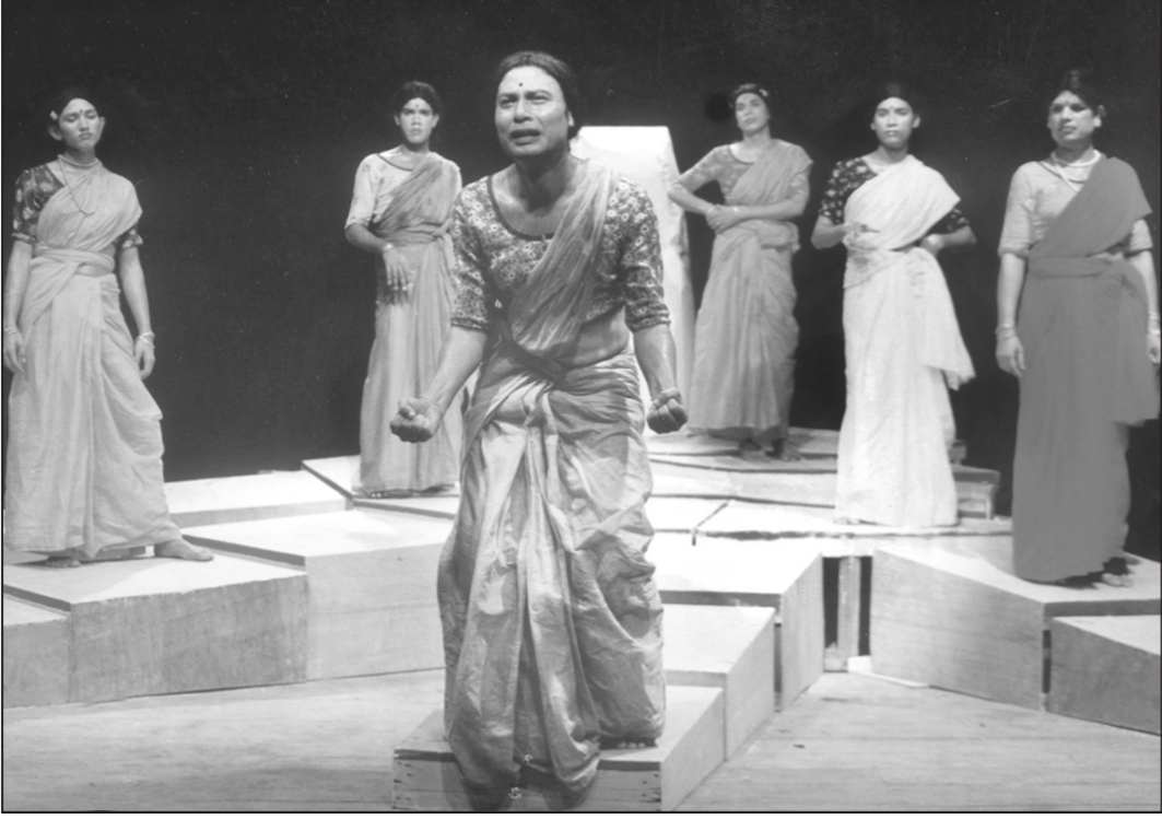
The characters of the play presenting the anguish of the sexually challenged

course of this search he even stands defiant before the Creator and demands a sexual identity. First, he wants to be made a man, full of vigorous manliness and capable of reproducing his own blood descendants.