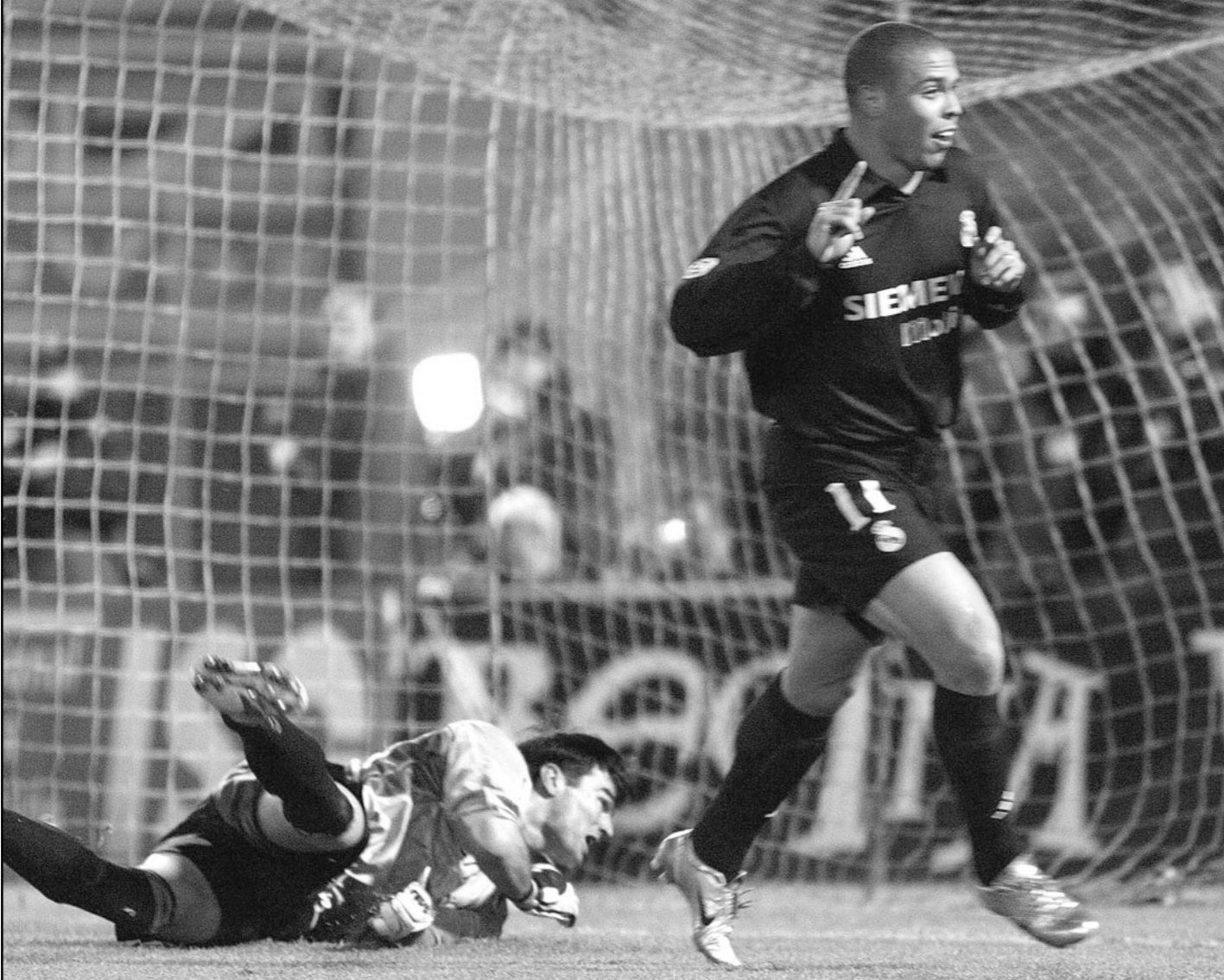
THAT WAS EASY! Real Madrid superstar Ronaldo (R) starts celebrating his goal while Celta de Vigo goalkeeper Pablo Cavallero lies on the ground at Balaidos stadium in Vigo on January 11.