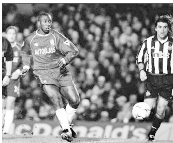
A file photo of Jimmy Floyd Hasselbaink.

But Stamford Bridge's money men are believed to want 7.5 million pounds for the player, who scored 33 goals last season and has already found the target 11 times in the current campaign.