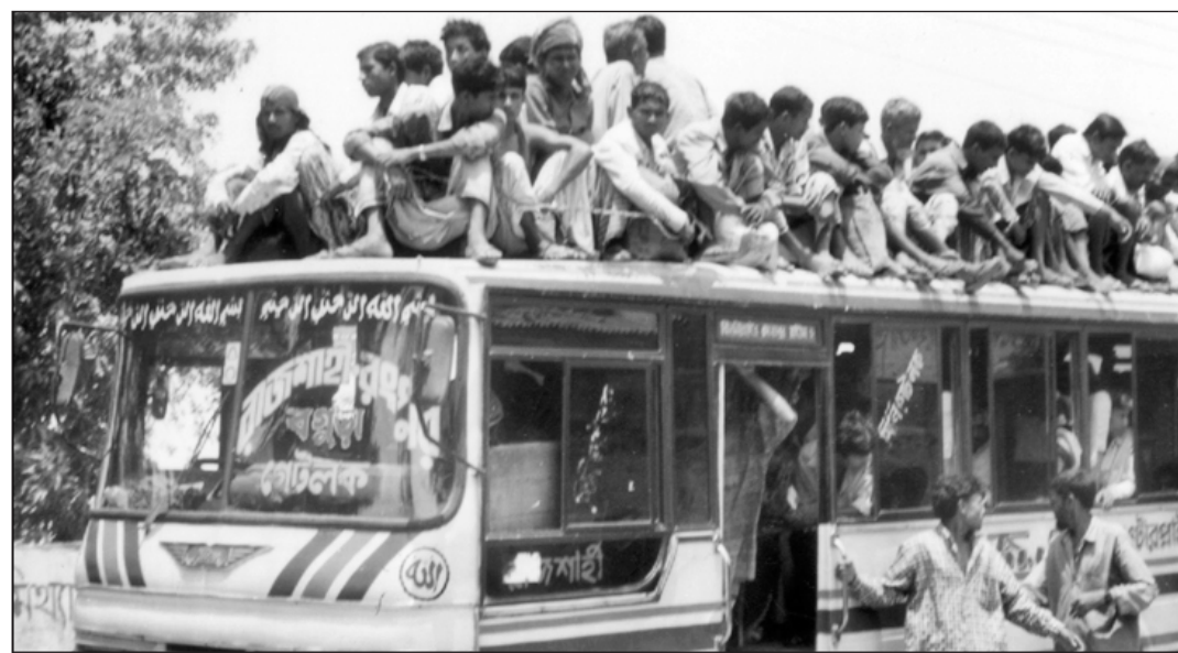
Some farm labourers of Gaibandha travelling on rooftop of a bus bound for Rajshahi. This winter agriculture workers are going to other districts in greater number in search of jobs. They will sell labour during the ongoing winter crops cultivation season.

In 2000, a total of 20 persons were killed while in the year of 1999, as many as 19 persons were killed.