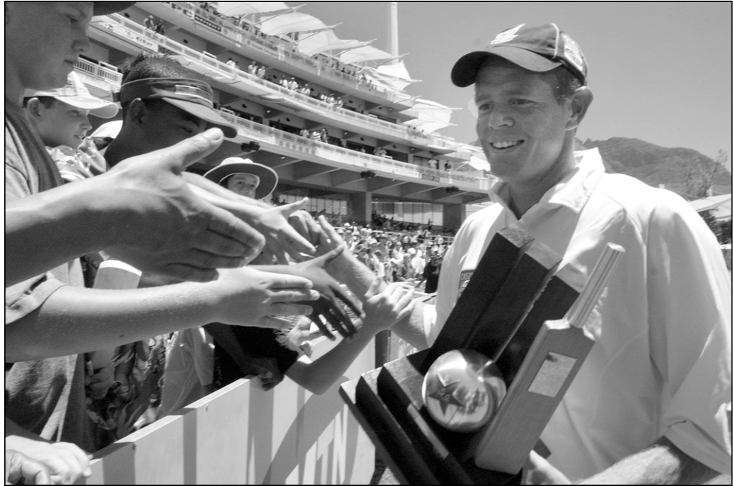
South African captain Shaun Pollock shows off the series trophy after winning the second and final Test against Pakistan at Cape Town yesterday.

Saqlain run out (Kirsten) 9 Waqar lbw b Hayward 9 Sami not out 9 Zahid c Pollock b Ntini 0 Extras: (lb-1, nb-3, w-1) 5 Total: (All out in 59.1 overs) 226 Fall of wickets: 1-0, 2-9, 3-130, 4-130, 5-184, 6-190, 7-203, 8-216, 9-221. Bowler O M R W Pollock 12 5 32 1 Ntini 15.1 2 33 4 Kallis 6 1 34 1 Hayward 11 3 44 1 Boje 15 0 82 2 Result: South Africa won by an innings and 142 runs. Series result: South Africa won 2-0. Man-of-the-match: Herschelle Gibbs. Man-of-the-series: Makhaya Ntini.