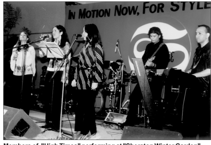
Members of "High Times" performing at "Sheraton Winter Garden"

The young women singers with their body-hugging blouses, draped gold belts and black slacks were partly imported phenomena while the rest of the players seemed the usual handful of young aspirants in the band music field, with the background music sometimes drowning the rendering of Madonna and Michael Jackson songs. The lights flashed behind and on the singers as well as on the dancers from time to time while the merry-makers, in the overtly western trend, danced the night away, impervious to the cold and any possible misery of the masses, not so far away in their slum hovels. "High Times" has earlier sung for charity but this was not such an occasion. It was all fun and frolic, impervious to any