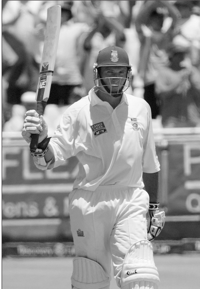
South Africa opener Graeme Smith raises his bat after reaching his half-century on the first day of the second Test against Pakistan in Cape Town yesterday.

South Africa fielded an unchanged team after winning the first Test in Durban by ten wickets last Sunday.