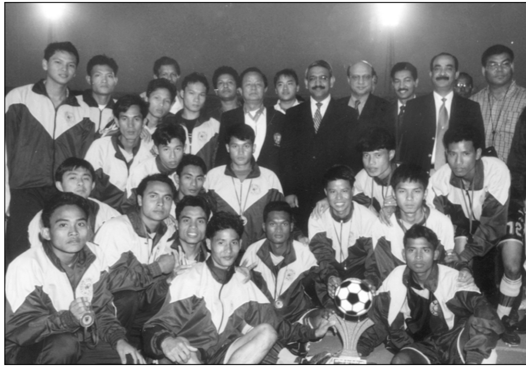
Players and officials of the victorious Rangamati team, who won the Tribal Football Championship, take a photograph with guests after the presentation ceremony at the Sher-e-Bangla National Stadium in Mirpur yesterday.