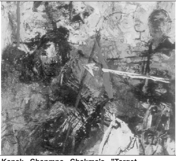
Kanak Champa Chakma's 'Target'

vermillion in the backdrop and scattered to the left. In front are waves of gray sweeping clouds intermingling with blue, beige and russet splashes.