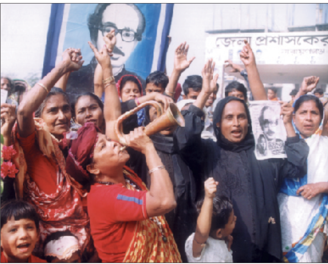
A woman blows a bugle during a Narayanganj Pourashabha election campaign in the Narayanganj town yesterday. The election is scheduled for January 16.