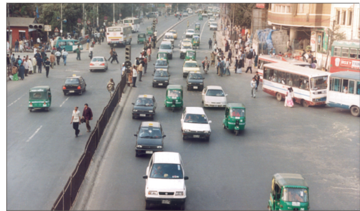
City thoroughfares like the one between Farmgate and Shahbagh were comparatively free from traffic jam yesterday as hundreds of two-stroke auto-rickshaws stayed off roads due to a ban.