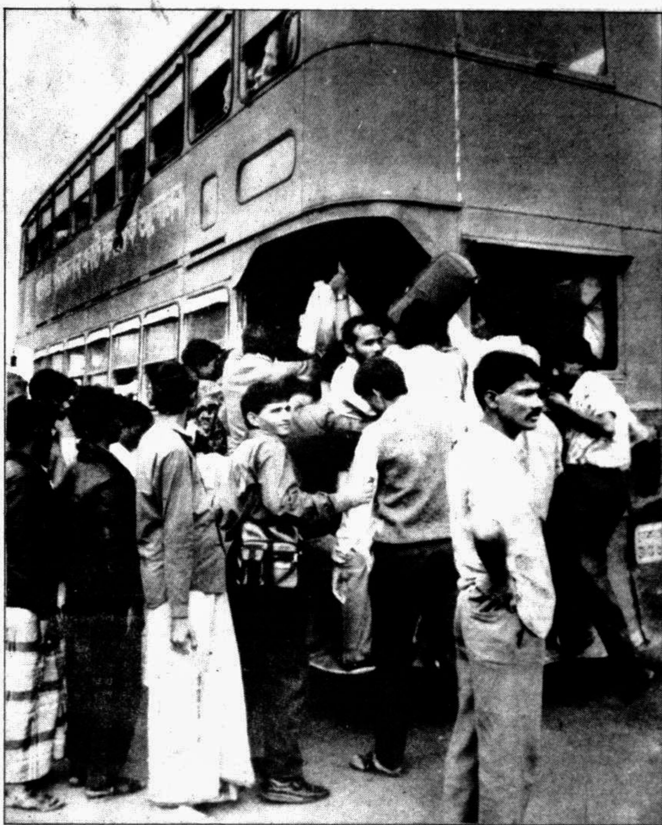
Pressure on BRTC buses increased yesterday as private transport owners enforced a strike.