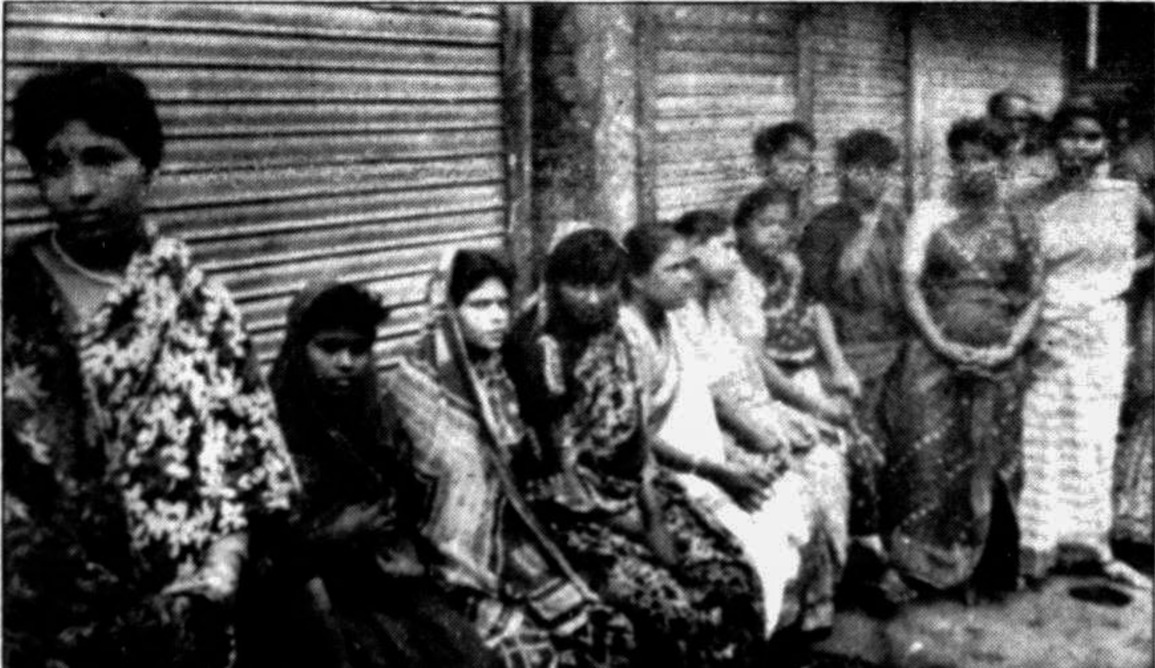
THE MOB AND THE WRETCHED : Top: Armed police blocking the way of anti-brothel processionists who tried to force their entry into the red-light area of Tanbazar in an eviction bid yesterday. Bottom: Prostitutes with uncertainty and helplessness take cover under a shed.