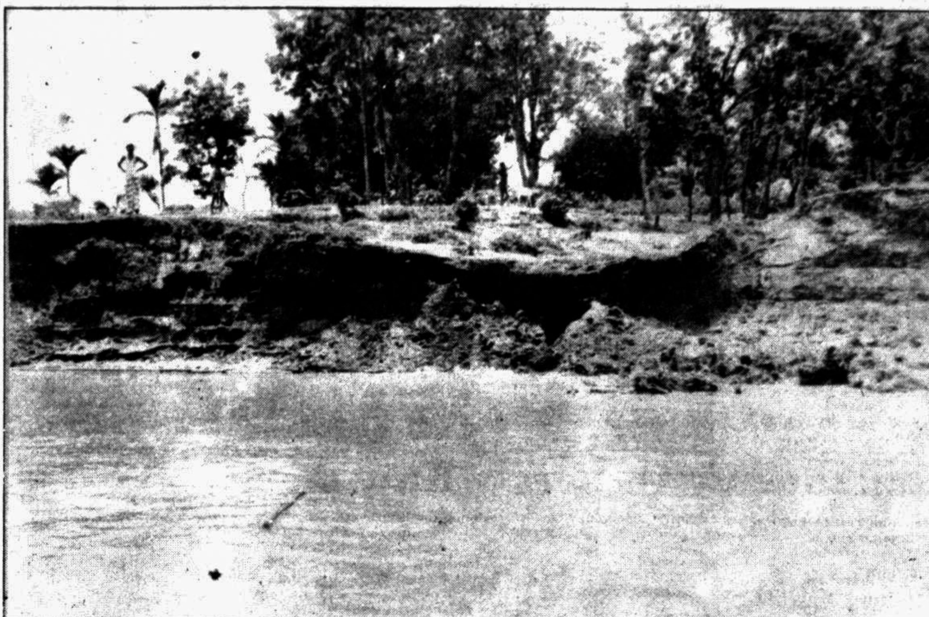
RANGPUR : A view of the erosion of the river Teesta at Gongachara.