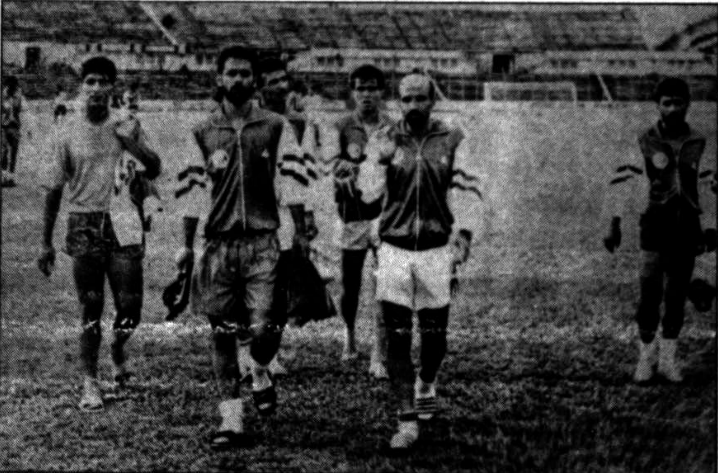
Goalkeepers of Iranian champions Esteghlal Club after their practice at Dhaka Stadium yesterday afternoon.

Before Al-Ramatha's withdrawal, the organisers had drawn up a budget of nearly 44 lakh taka. The BFF hoped to earn almost double that