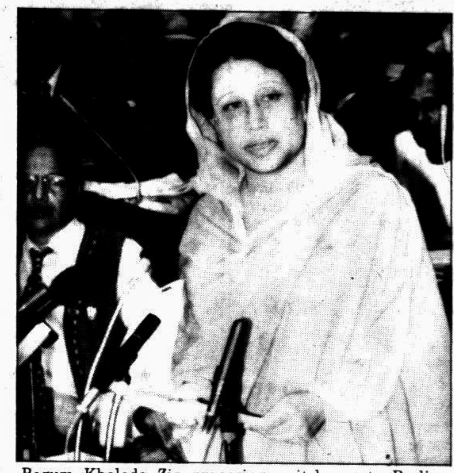
Begum Khaleda Zia proposing switchover to Parliamentary democracy through the Constitution amendment bill placed before parliament Tuesday evening.

some other members of the party any group within that party, acts in Parliament against the decision of the party and votes in Parliament against the party. If any member loses his seat due to the above reasons he shall be disqualified for election as a member of Parliament for a period of five years from the date of his seat falling vacant. In limiting the power of the President the amendment proposed that the President shall not dissolve Parliament without written advice from the Prime Minister. Regarding the election of the President the proposed amendment provides for the election to be arranged by the Speaker. The posts of Vice-President and Deputy Prime Ministers have been dropped in the bill. On the formation of the cabinet the amendment proposed that the cabinet shall be headed by the Prime Minister and one fifth of its members can be taken from non-members.