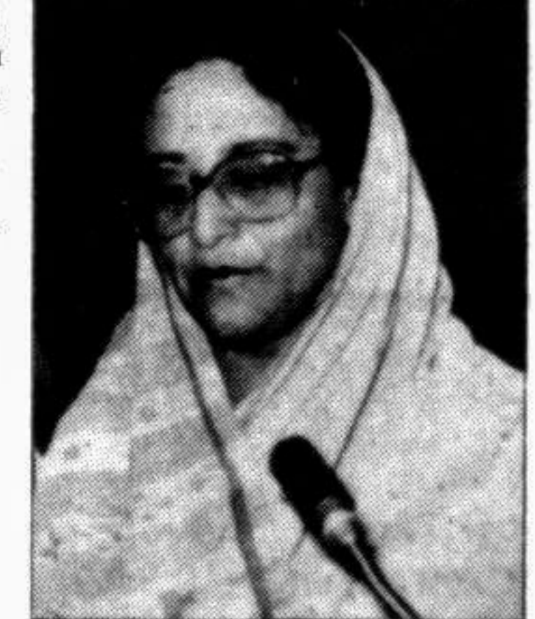
Sheikh Hasina : We have been fighting for parliamentary democracy since 1978.

By Staff Correspondent Awami League chief and Leader of the Opposition in Parliament Sheikh Hasina thanked the Leader of the House Khaleda Zia for introducing the Constitution amendment bill Tuesday for switching over to parliamentary system. While speaking on the amendment bill placed by the Prime Minister before the House in the evening, Sheikh Hasina said, "though belated, the bill was brought bowing down to public opinion." She called upon the Treasury Bench to arrange introduction of Awami League's amendment bill on the same