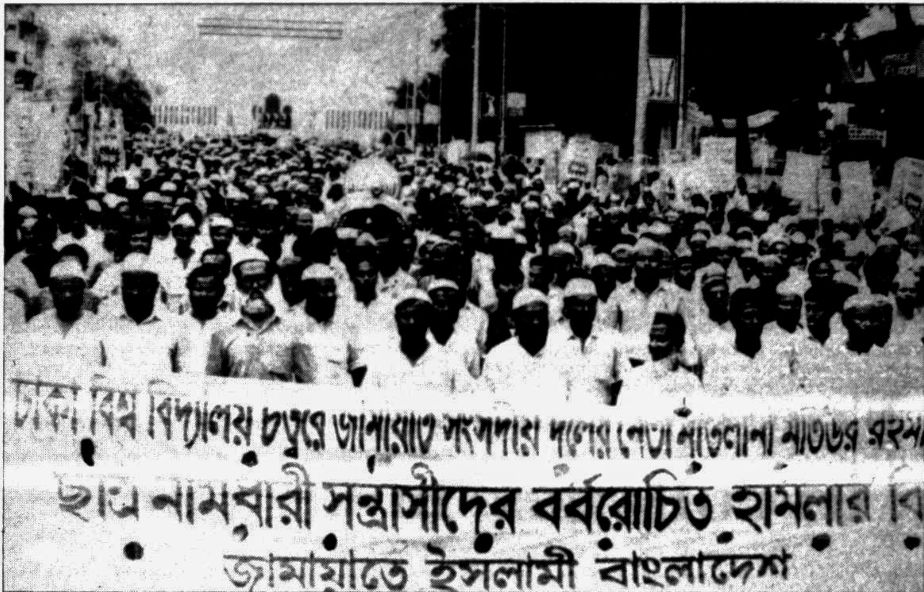
Jamaat-e-Islami brought out a procession in the city on Friday demanding punishment of those responsible for the attack on Maulana Nizami in the Dhaka University. News on page 3